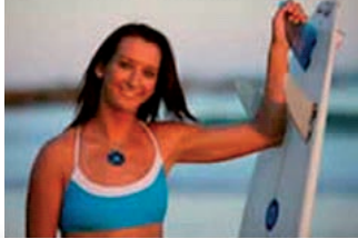
Layne Beachley 7 times World Surfing Champion Australia

“SCENAR supported my nervous system, encouraged my body to heal, allowed me to maintain strength and fitness so I could compete at my optimum level ”